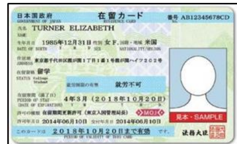
Resident Card Both visa and expiration date must be valid.