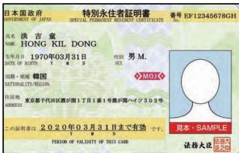
Special Resident Permanent Certificate