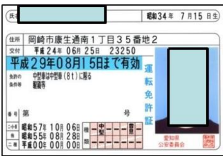
Japanese Driver's License Must have additional document See next page