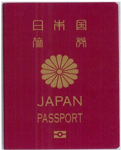
Japan/Foreign Passport Valid visa required for non-Japanese